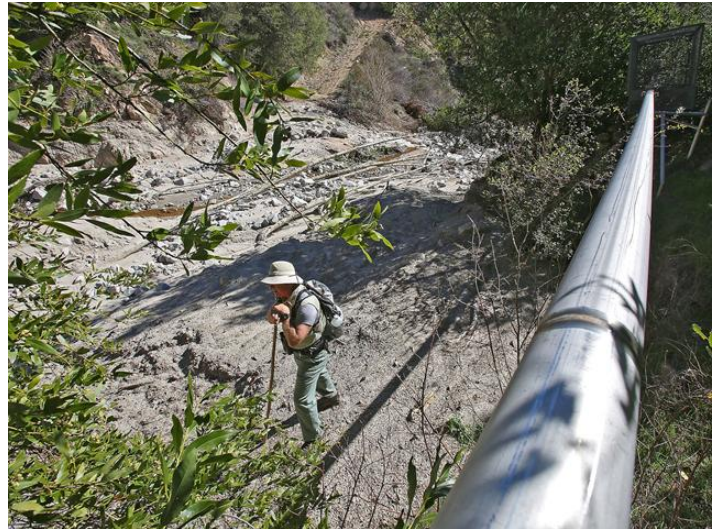
Gary Earney in Strawberry Creek

It is his view that harvesting water during the drought has damaged the water table's ability to recover during the winter, further endangering the wildlife and forest below the horizontal wells the company uses to tap the water table. Nestlé could allow water to escape in support of the environment, but choose not to.