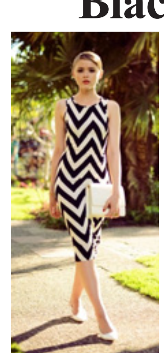
tering months to come, and pretty bold. I see